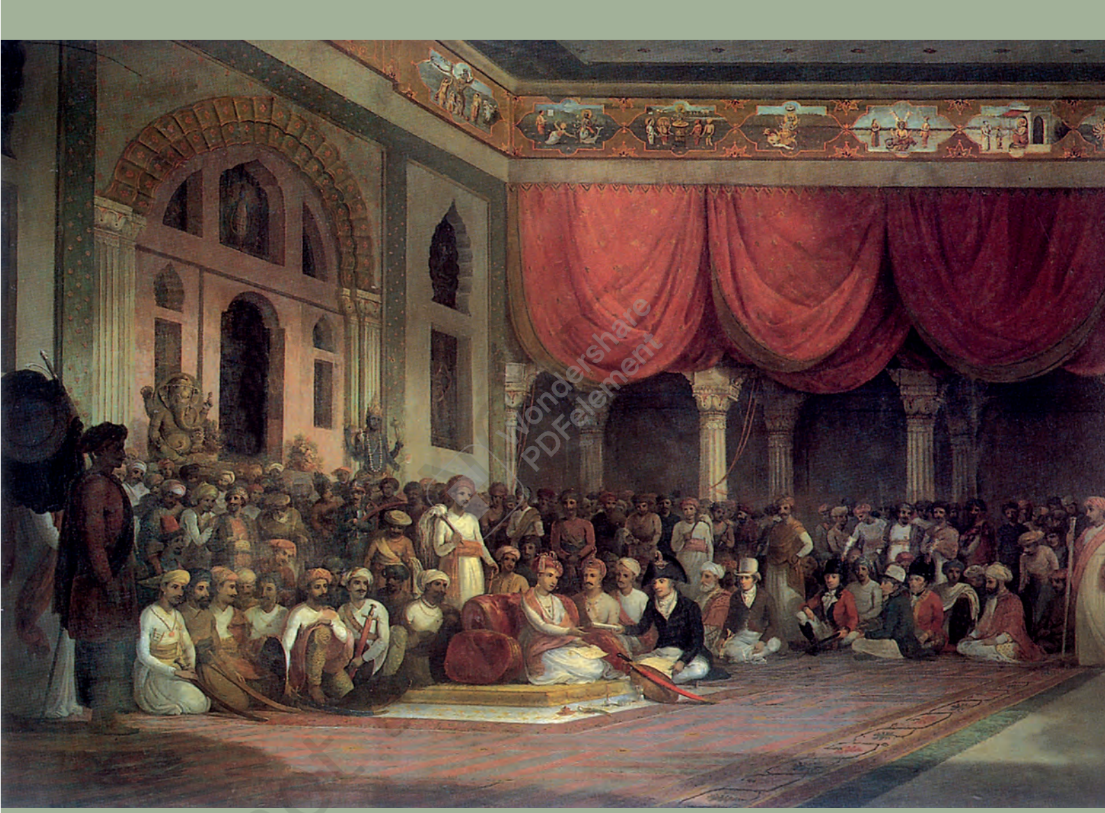
The British Resident at the court of Poona concluding a treaty, 1790